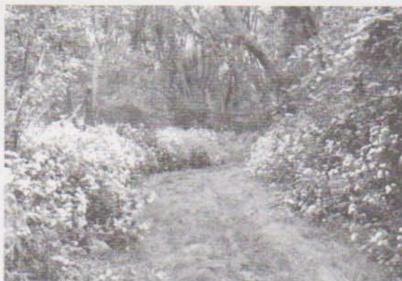
A view of summer in Kishwauketoe—lush, diverse and everchanging. Four miles of managed paths circle the Conservancy grounds.